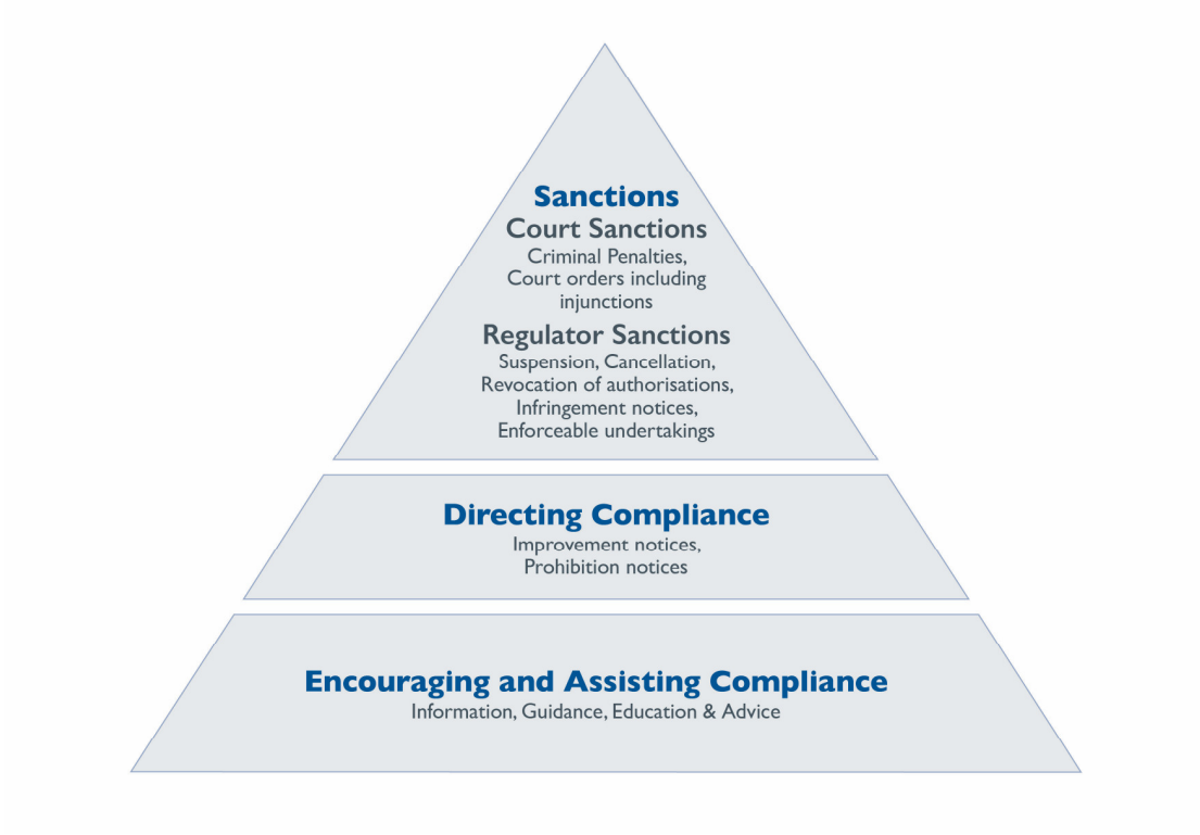
Figure 1: WHS compliance pyramid (SWA, 2011e)<sup>13</sup>

Based on the National Compliance and Enforcement Policy (SWA, 2011e) developed cooperatively by all OHS regulators, each jurisdiction has a policy that guides its choice of options and enforcement tools. These policies adopt a risk-based and responsive compliance and enforcement strategy underpinned by the principles of consistency, constructiveness, transparency, accountability and proportionality. Pursuant to the policies, inspectors and regulators seek to match the most appropriate enforcement tool with the seriousness of the contravention, the culpability of the offending duty holder, and the level of risk and harm.